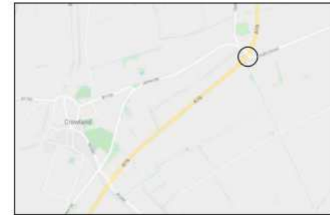
Appendix A: Proposed Experimental traffic order to prohibit traffic movements at Crowland: A16/B1166 Radar Junction and A16/ B1040 junction and A16 southbound layby